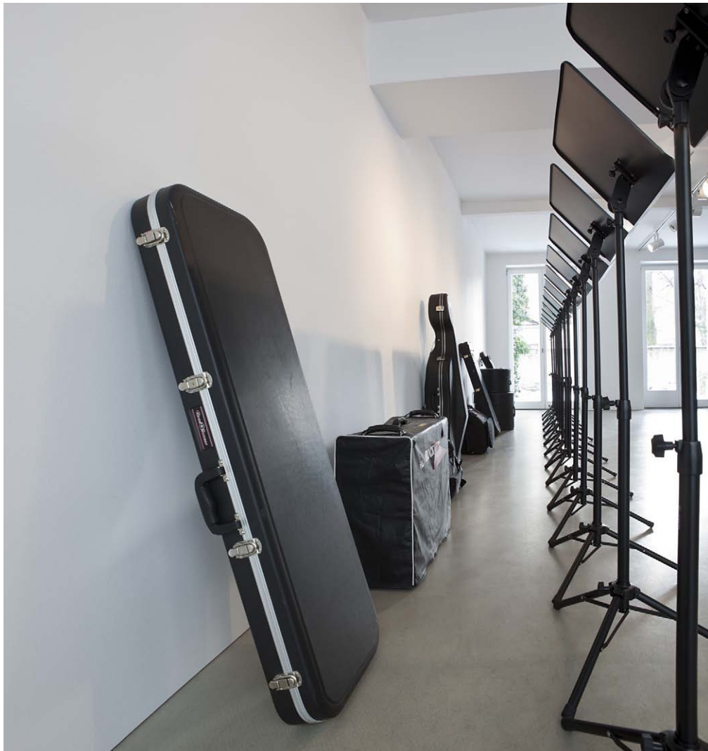
Installation views Songbook ES13 (Start Position), Esther Schipper, Berlin, 2013