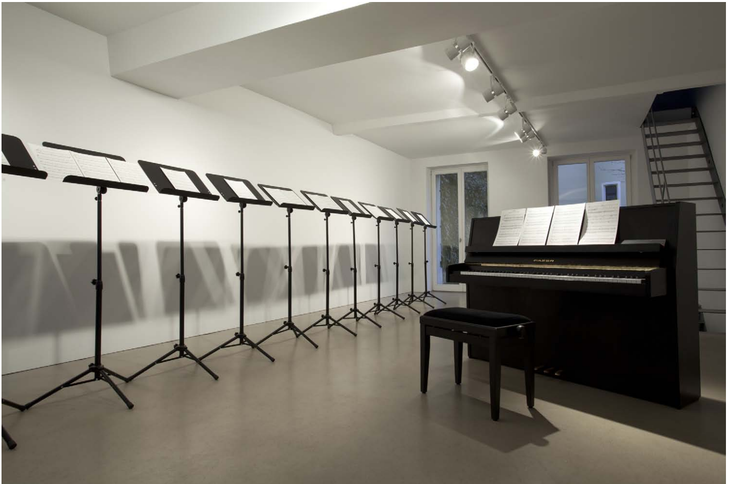
Installation view Songbook ES13 (End Position), Esther Schipper, Berlin, 2013