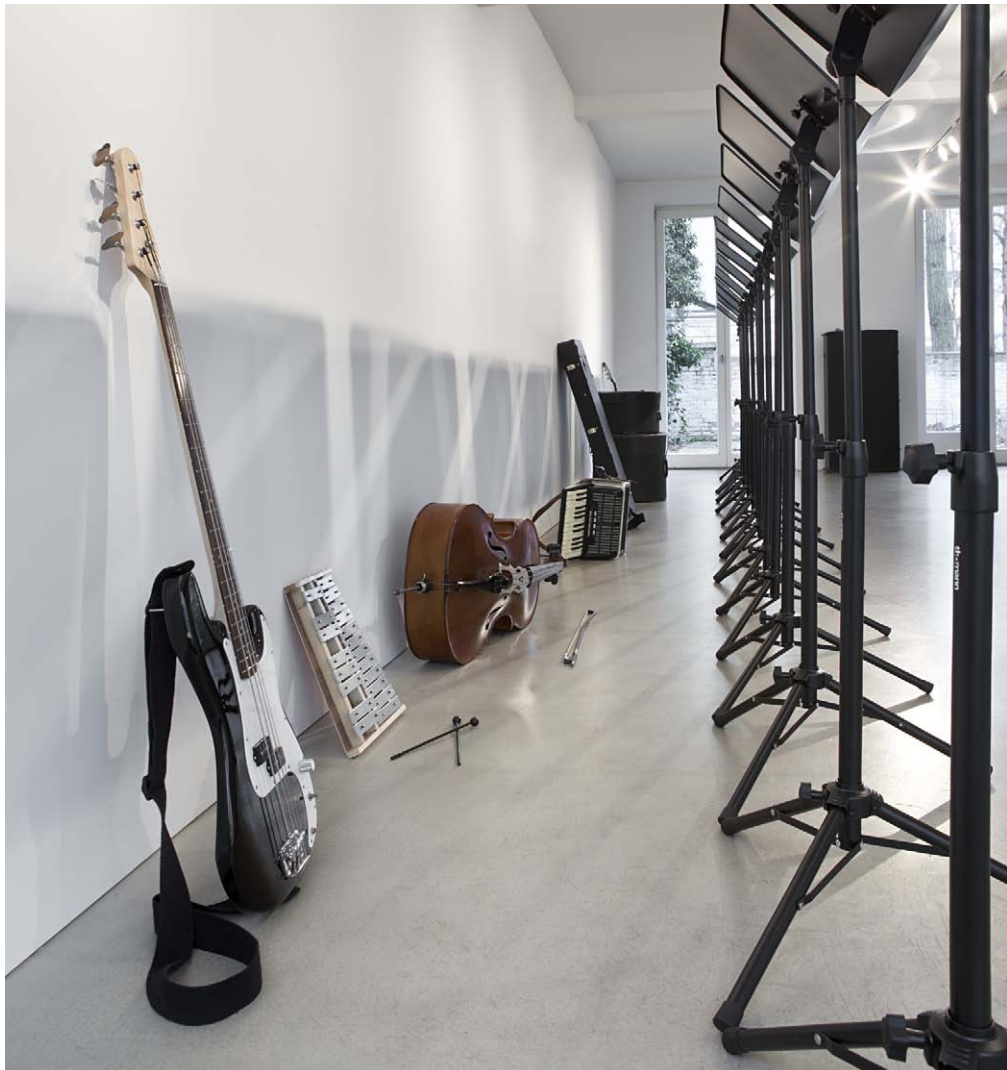
Installation views Songbook ES13 (Rehearsal Position), Esther Schipper, Berlin, 2013