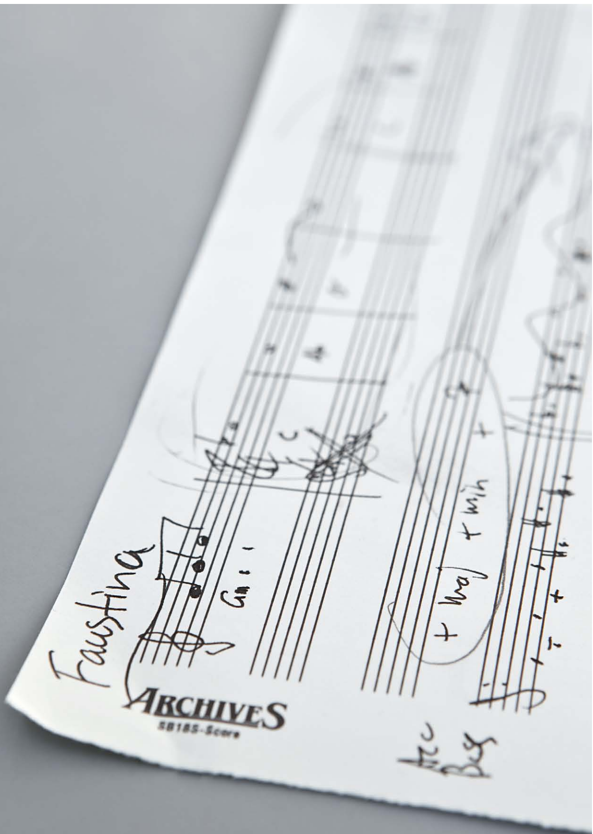
Songbook ES13, 2013 (Detail)