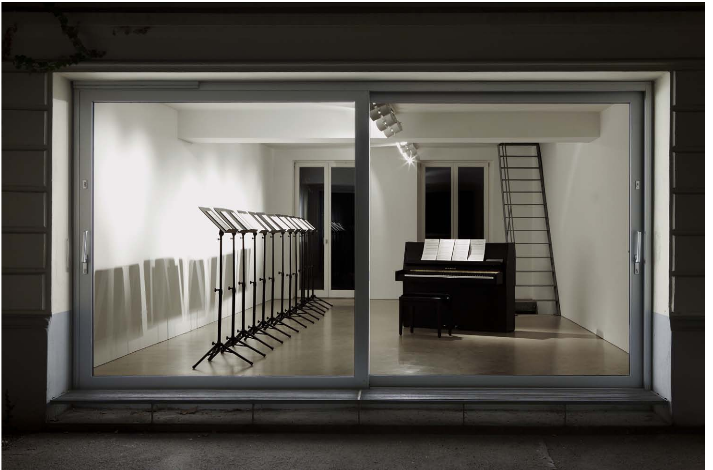
Installation view Songbook ES13 (End Position), Esther Schipper, Berlin, 2013