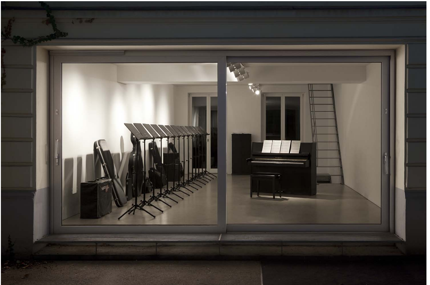
Installation view Songbook ES13, (Start Position), Esther Schipper, Berlin, 2013