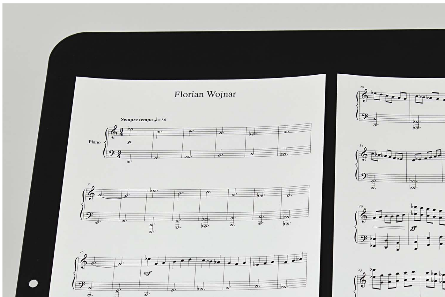
Songbook ES13, 2013 (Detail) Printed score on paper, music stands Overall variable (AM002)