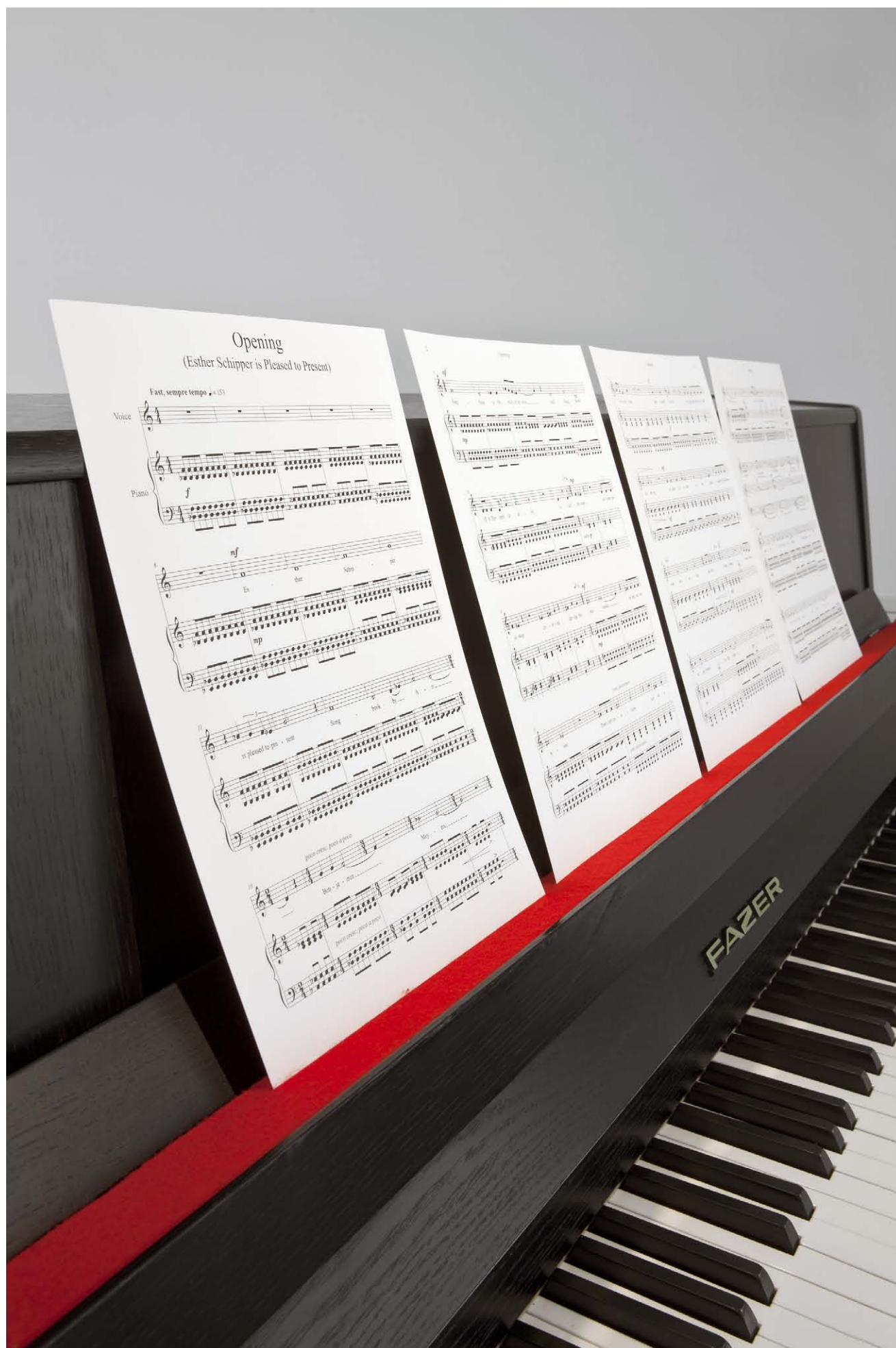
Songbook ES13, 2013 (Detail)