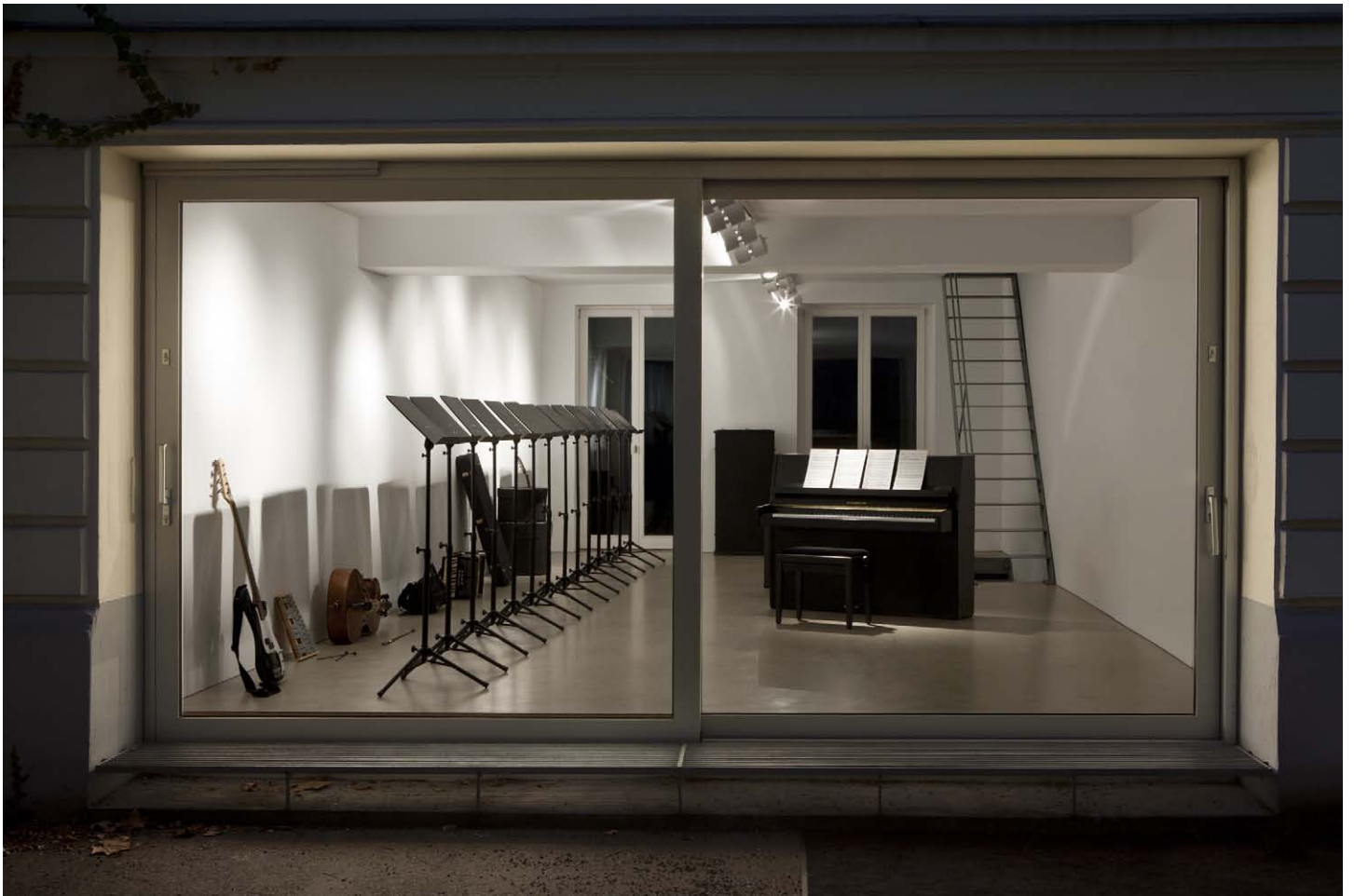
Installation view Songbook ES13 (Rehearsal Position), Esther Schipper, Berlin, 2013