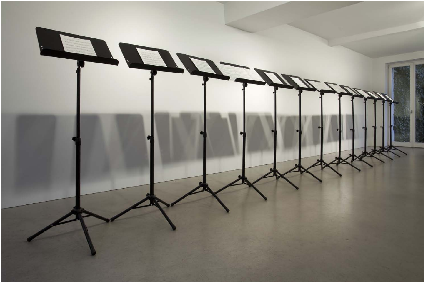
Installation view Songbook ES13 (End Position), Esther Schipper, Berlin, 2013